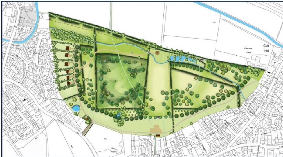
Illustration of revised proposal